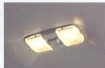
ROOM LAMP 10W X-2 FOR BRIGHTER INTERIOR.