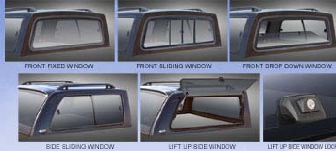
FRONT FIXED WINDOW

THE SIDE SLIDING WINDOWS ARE FITTED AS STANDARD OR YOU CAN CHOOSE THE LOCKABLE LIFT UP SIDE WINDOWS AS AN OPTION, TO ALLOW BETTER ACCESS TO THE CARGO AREA.