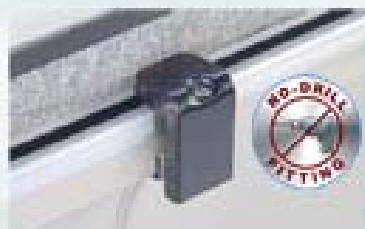
ALPHA CLAMPING SYSTEM THE CANOPY CAN BE FITTED WITHOUT DRILLING THE VEHICLE.

THE AVAILABLE OPTIONS MAKE ALPHA CANOPIES THE MOST VERSATILE CHOICE AVAILABLE ON THE MARKET.